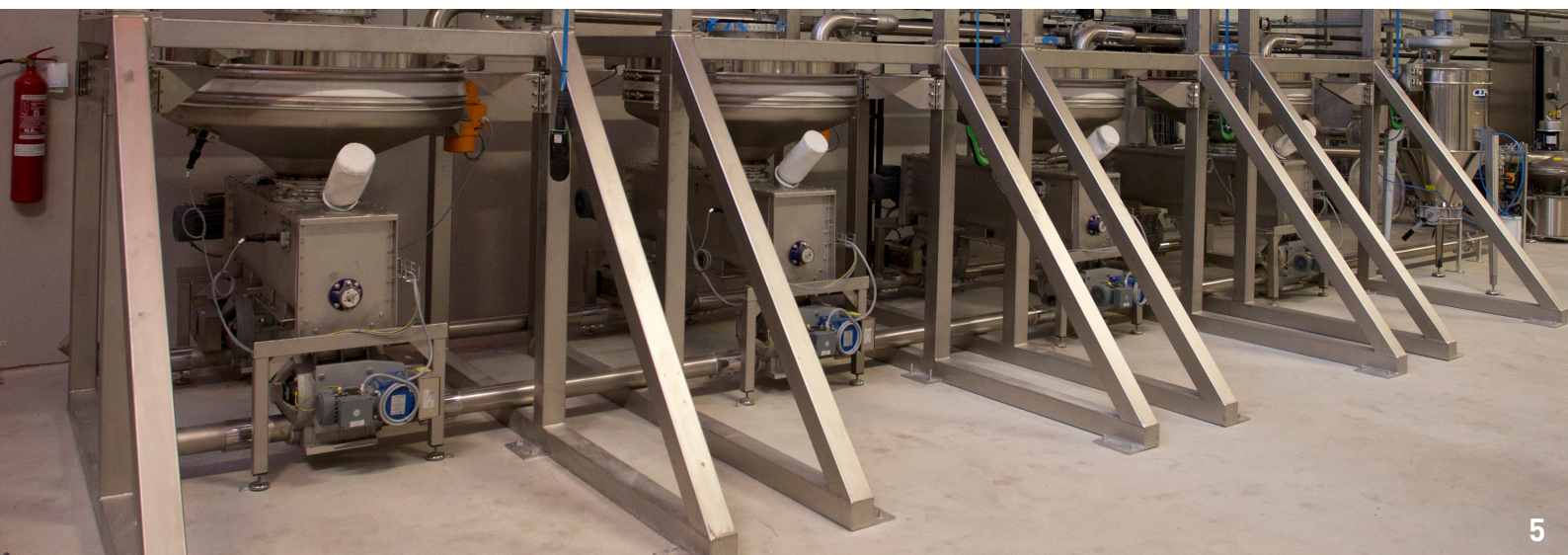
1 System to reuse Big bag 2 Extraction with vibrating cone 3 Chain hoist to load bags 4 Antidust filter 5 Multiline feeding