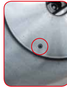
Probe in direct contact with the mix