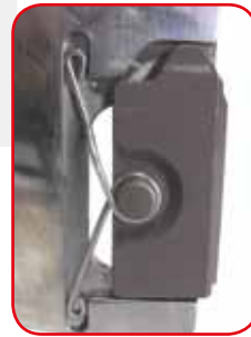
Detail: interchangeable metal scraper