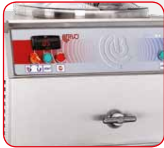
Slanting front panel with rounded anti-drip upper edge. Thermo-regulator with "sensible touch" display